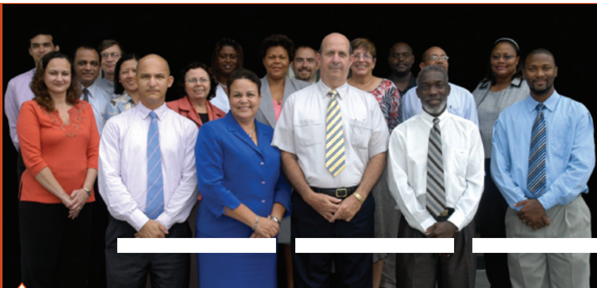
Members of the cross-ministerial National Assessment Team captured in this photo following the launching meeting of NALC in October 2006.

Results from both studies will be tabulated without reference to any particular household or household address, producing statistics on the state of living conditions of the population as a whole.