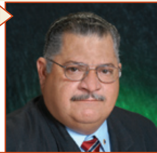
The Minister of Health and Human Services, the Hon. Anthony S. Eden, OBE, JP

Reduction of poverty means enhanced freedom for our people. And freedom ensures participation in national decision-making.