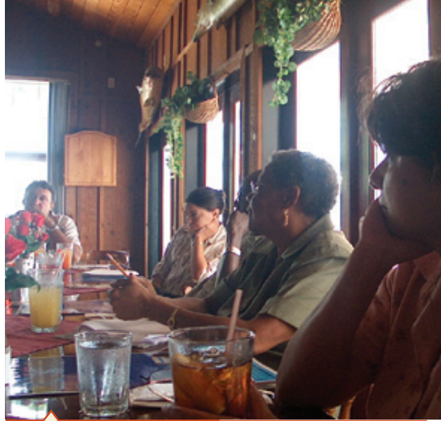
Facilitators and NAT Committee members in Cayman Brac training for the Participatory Poverty Assessment.